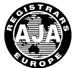
Chief Executive and Operations Director, AJA Registrars Europe

This certificate is issued in respect of the locations & scope of registration detailed in the Associated Registration Schedule. This certificate is the property of AJA Registrars Europe and must be returned on request.