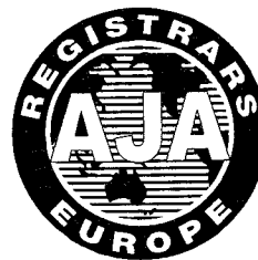
Chief Executive and Operations Director, AJA Registrars Europe

This certificate is the property of AJA Registrars Europe and must be returned on request